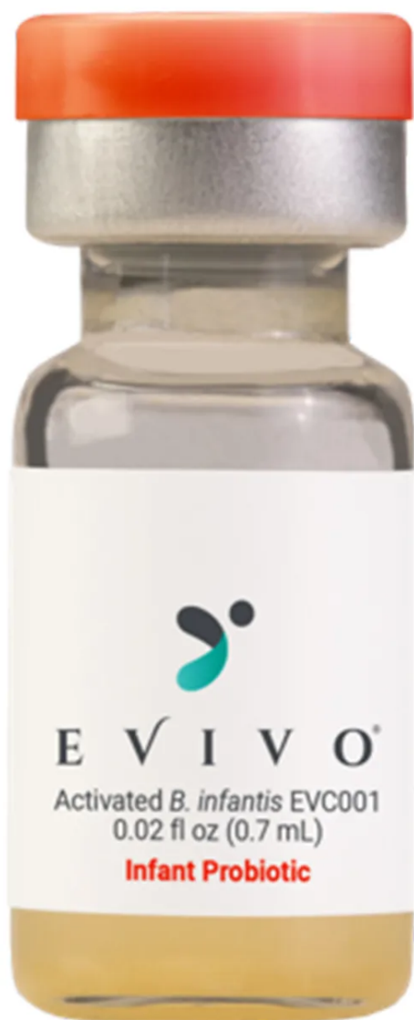
Infinant Health's Evivo with MCT Oil probiotic. Evivo

A spokesperson for Infinant Health told TODAY.com in a statement that it is cooperating with the investigation and that patient safety is its top priority. The company recalled the probiotic and has informed its health care providers, it said.